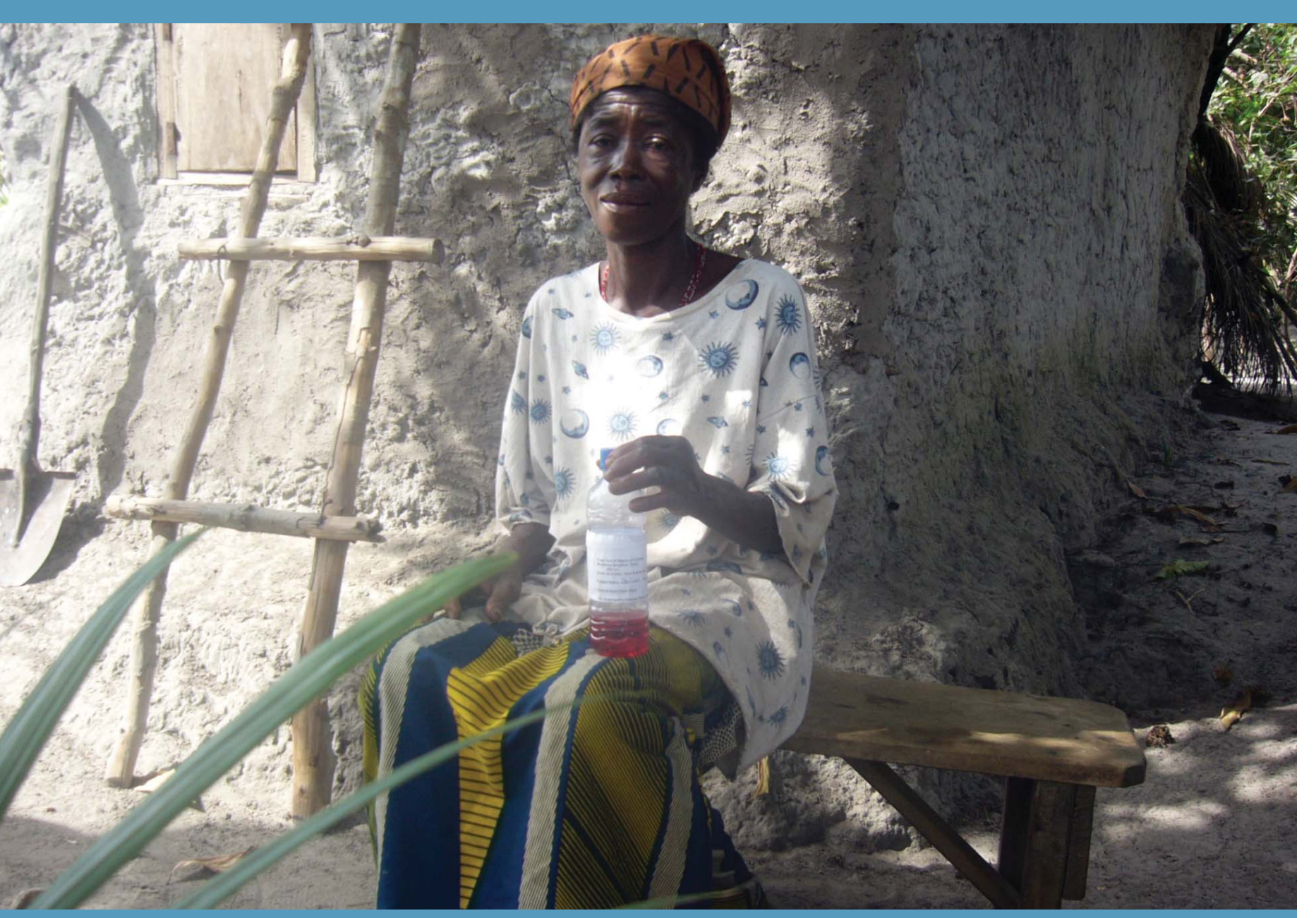
A cancer patient receives a morphine solution in Sierra Leone, following the country's first import of the medicine.