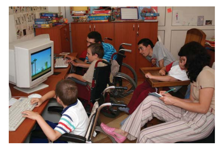
Hospice Casa Sperantei in Brasov, Romania, serves patients of all ages, including children

Appreciation of the problems and needs of ill and dying children is growing in the health and palliative care communities. The WHO has promulgated an official definition for children meriting pediatric palliative care. It includes children not just with "life-limiting" illnesses (as in adult definitions) but also with "life-threatening" ones, such as severe disabilities requiring serious interventions and diseases that might be cured, including earlier-stage cancers. The guidelines also recommend age- and weight-appropriate dosages of medications.