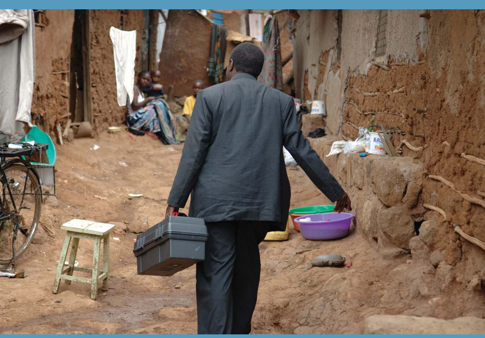
A doctor travels to rural communities in Kenva to provide palliative care services