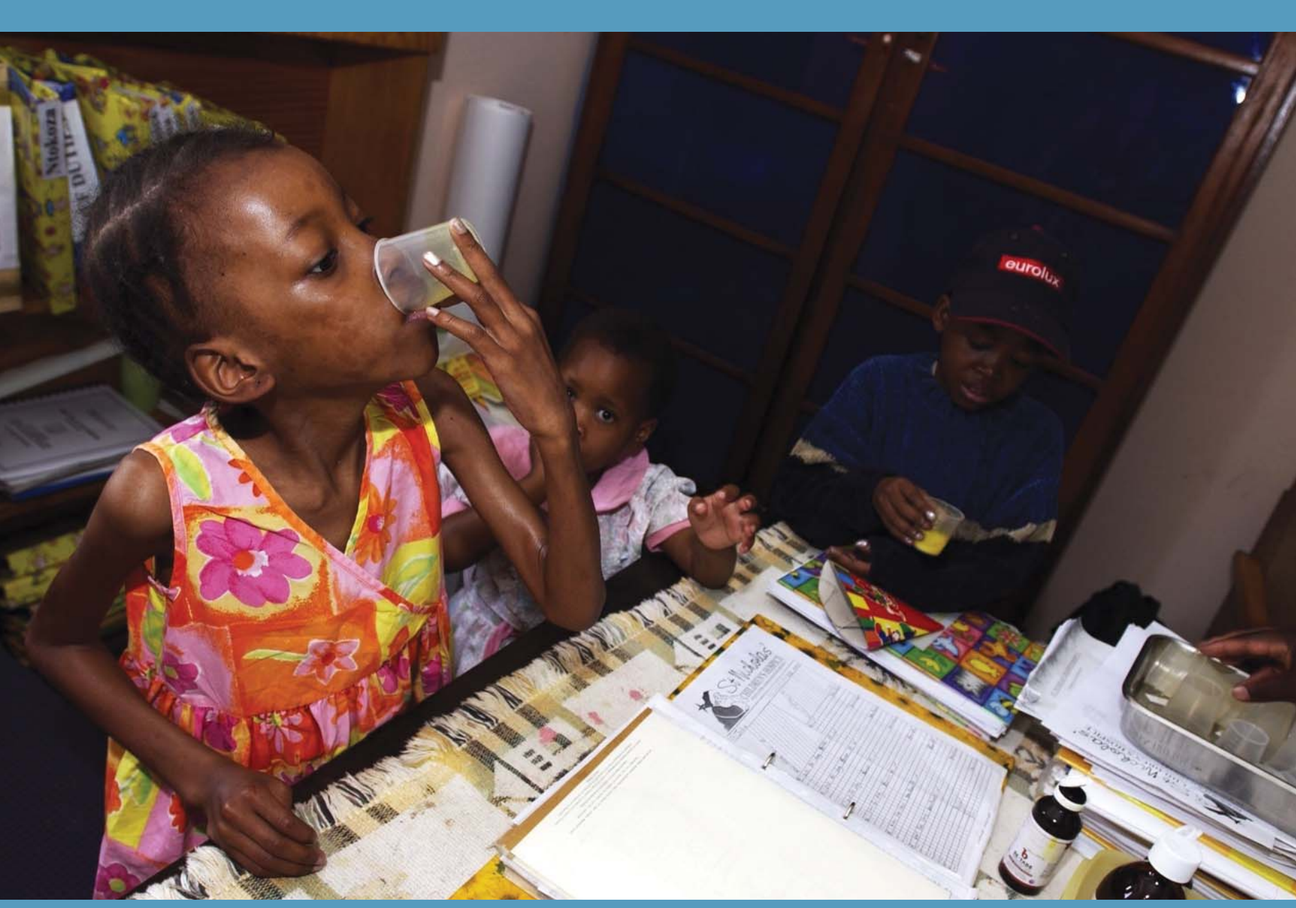
Children receiving antiretroviral medicine in South Africa