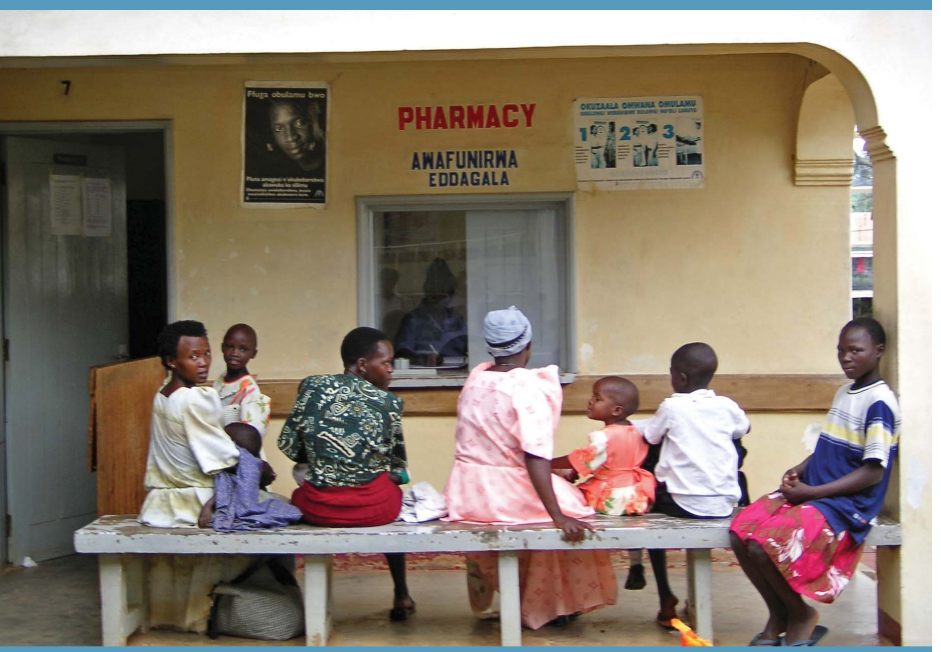
Families wait for medicines outside a pharmacy in Uganda