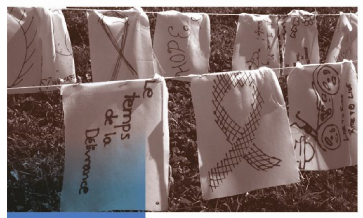
Photo: International AIDS Conference Toronto, 2006